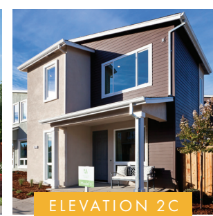
ELEVATION 2C (MODELED)