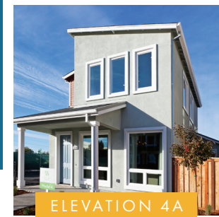
ELEVATION 4A (MODELED)

Approx. 1,576 Sq. Ft. | 2 Bedrooms + Loft | 2.5 Bathrooms | 1-Car Garage