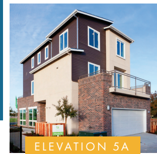
ELEVATION 5A (REVERSED)

Approx. 2,390 Sq. Ft. | 3 Bedrooms + Bonus Room | 2.5 Baths | Deck | 2-Car Garage